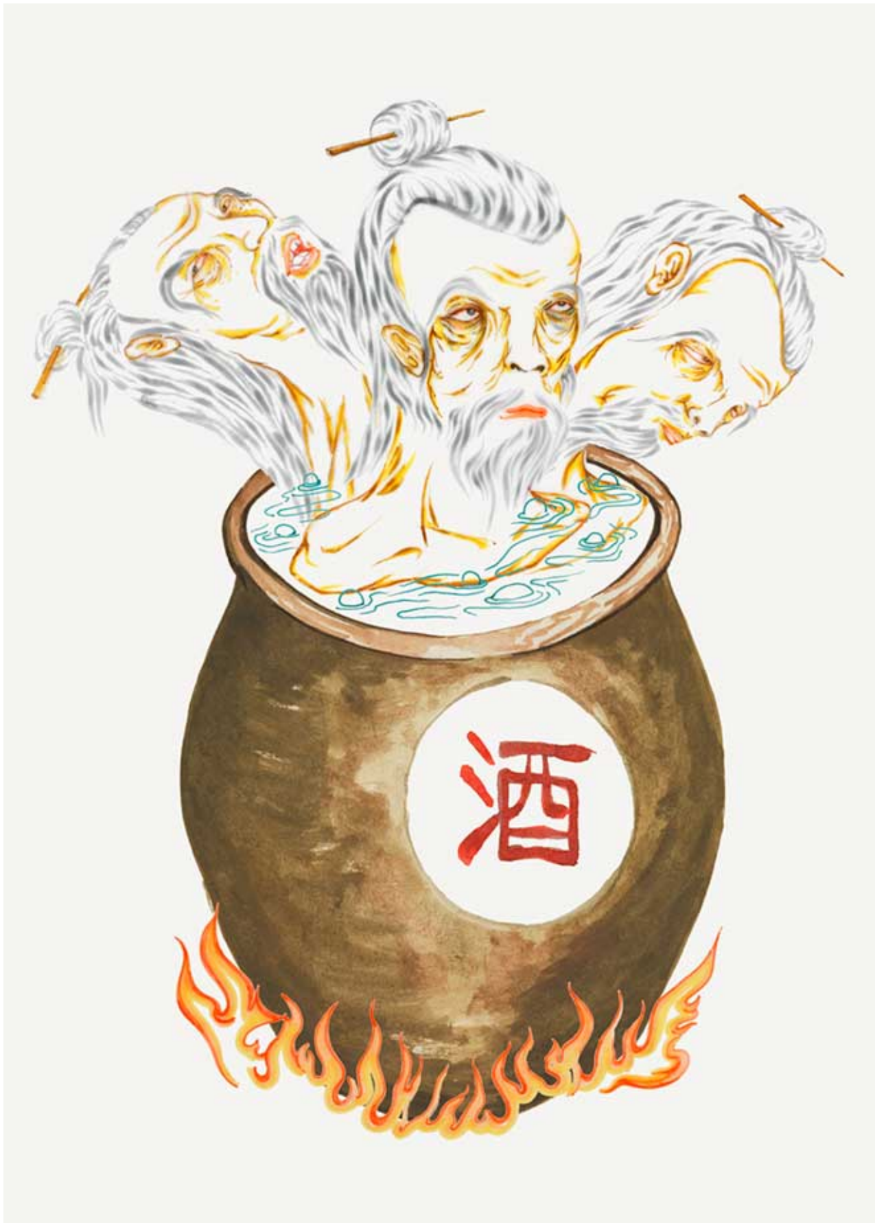
Howie Tsui, Retainers of Anarchy , 2017. Animation key frame drawing, 5-channel HD video installation, 4-channel audio.